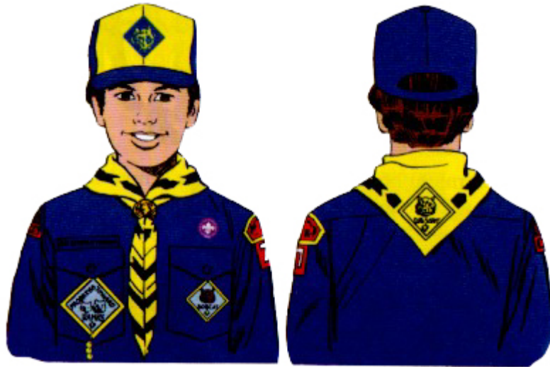
"Class A" Uniform